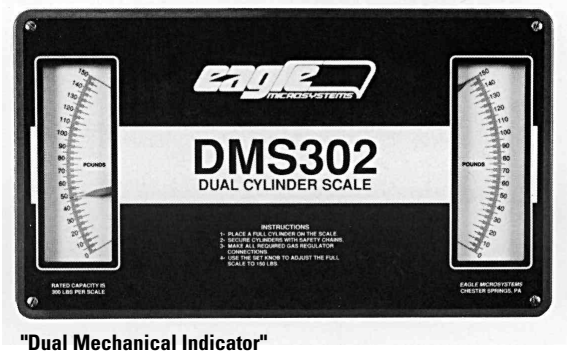
"Dual Mechanical Indicator"